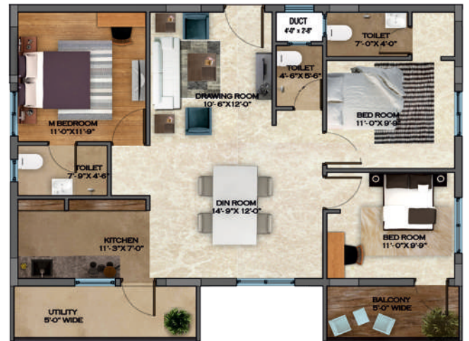
West Facing 3BHK 1399 Sq.ft.