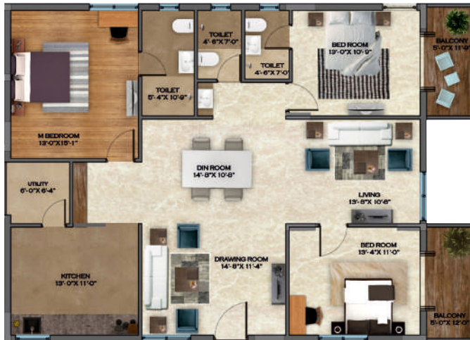
East Facing 3BHK 2026 Sq.ft.