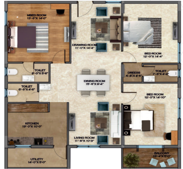
West Facing 3BHK 1880 Sq.ft.