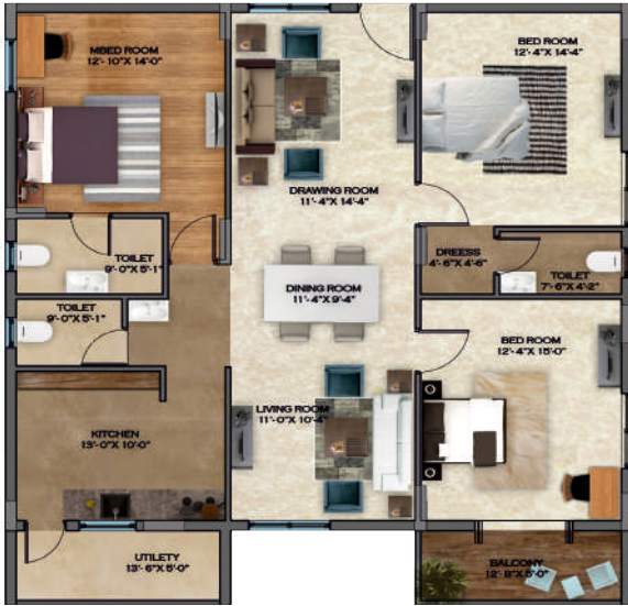
West Facing 3BHK 1880 Sq.ft.