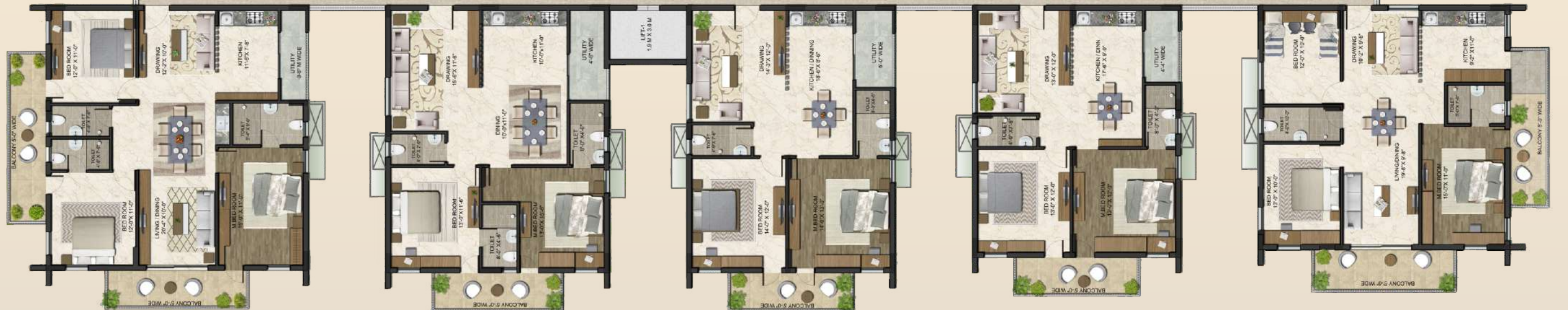
Flat No 6 East 1562 Sft 3 BHK