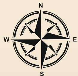
Flat No 2 East 1735 Sft 3 BHK