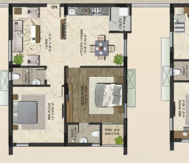
Flat No 5 East 1119 Sft 2 BHK