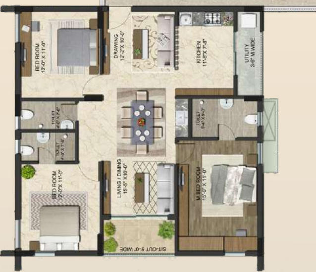
Flat No 2 East 1469 Sft 3 BHK