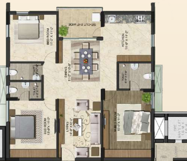
Flat No 8 West 1512 Sft 3 BHK