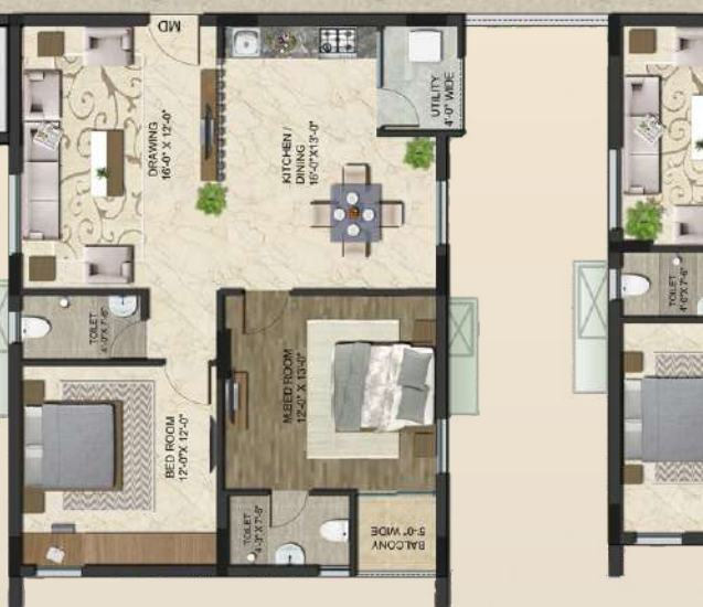
Flat No 4 East 1190 Sft 2 BHK