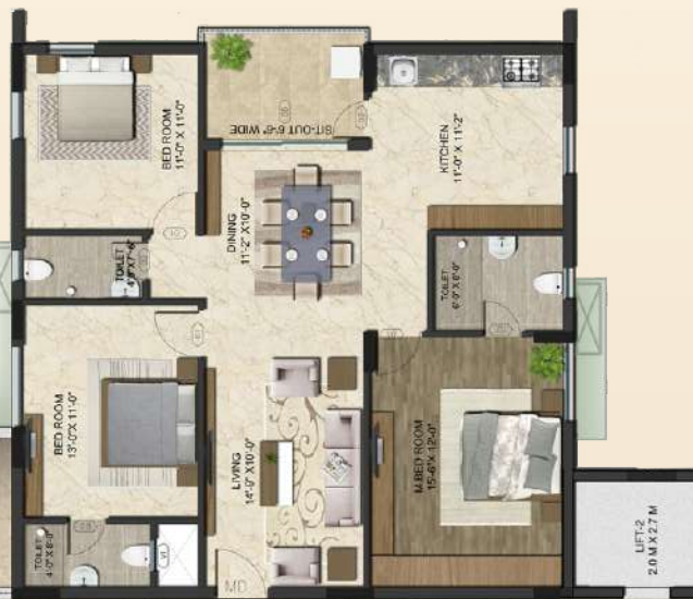
Flat No 9 East 1549 Sft 3 BHK