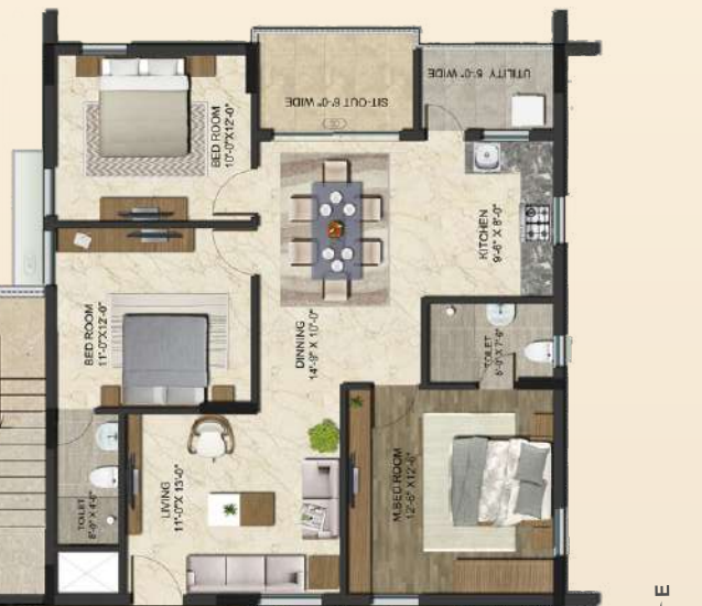
Flat No 7 West 1417 Sft 3 BHK