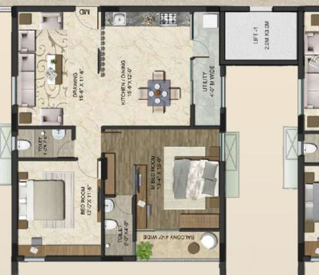
Flat No 3 East 1275 Sft 2 BHK