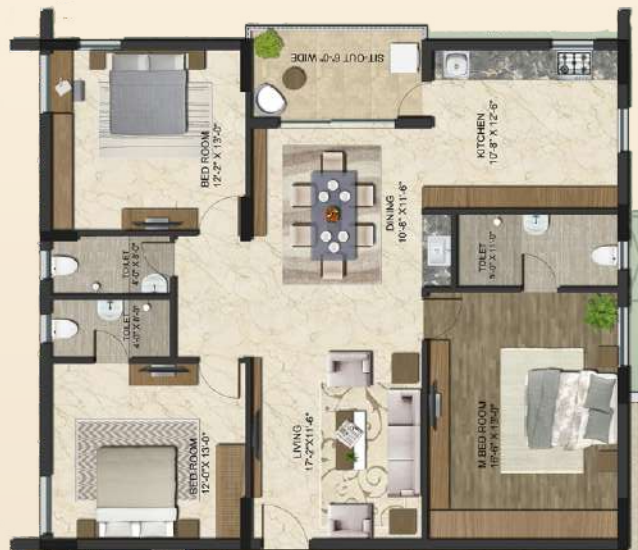
Flat No 1 East 1762 Sft 3 BHK